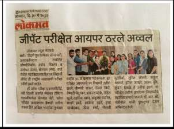
Academic honour and accomplishments of IPERites