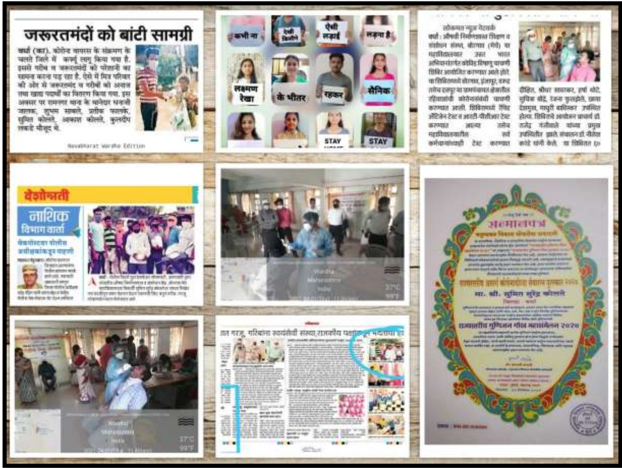
Gratitude Towards Society During COVID Pandemic