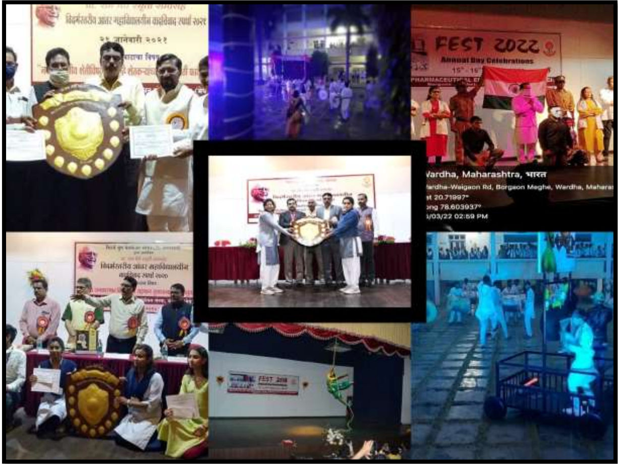
Students of IPER Shines at the Regional Debate Competition and Cultural Activities