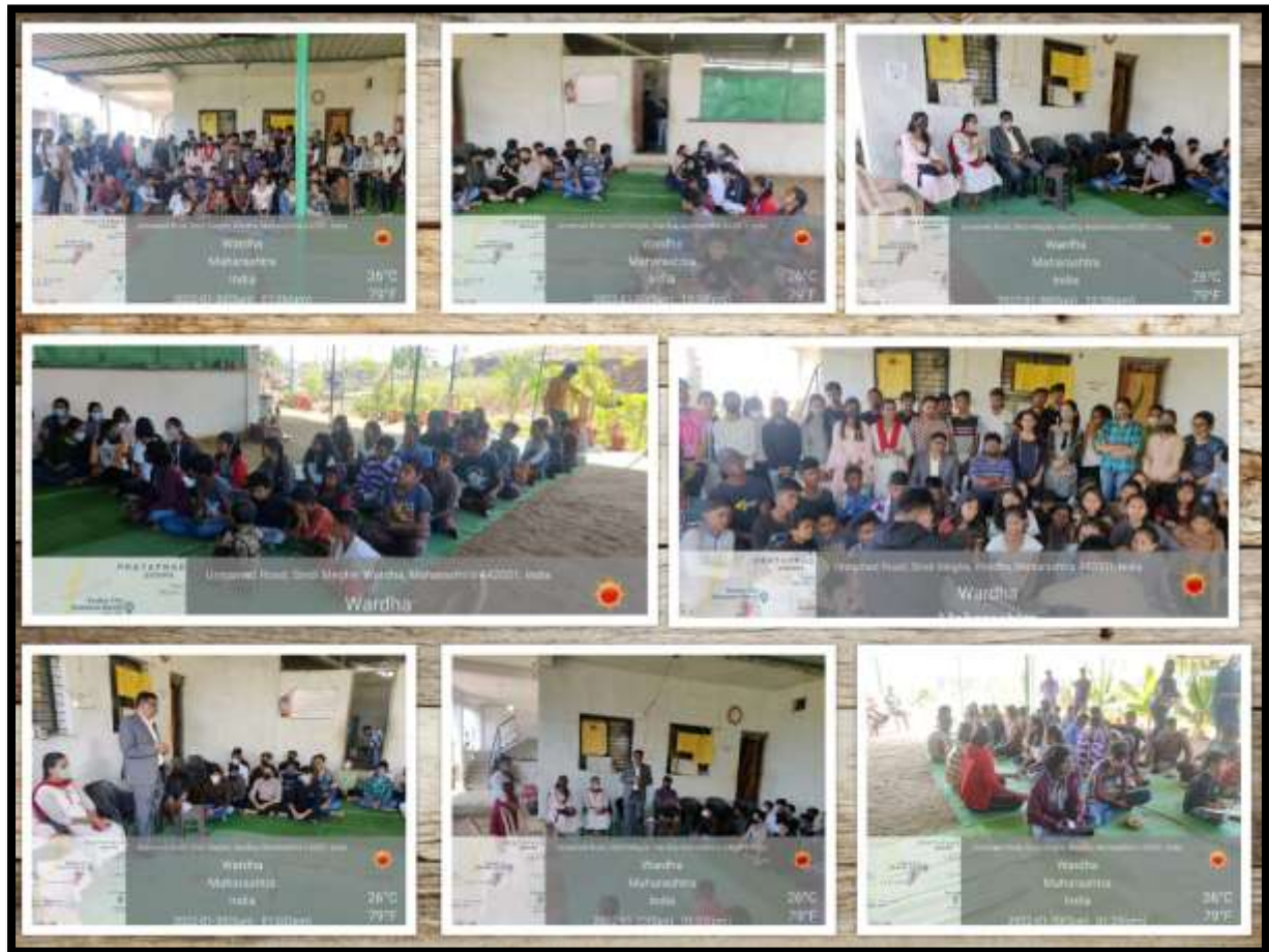
Gratitude Towards Society and most deprived citizen