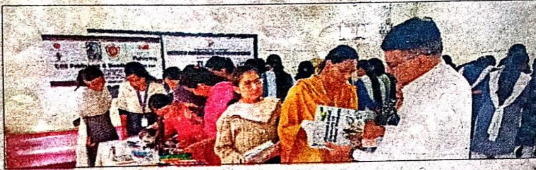
Students attending the event at IPER.