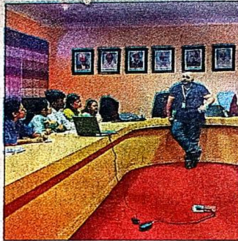
Glimpse of the placement drive.