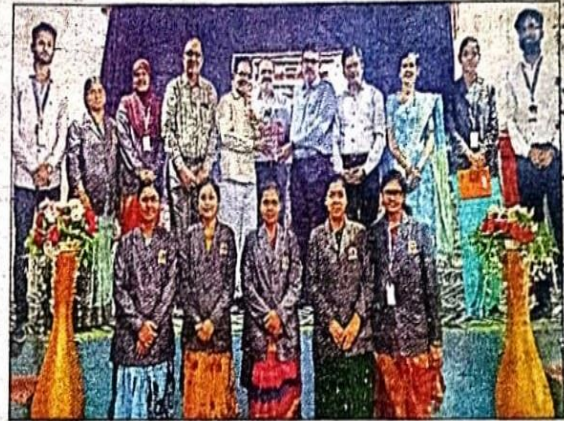
Dignitaries and staff of St Thomas School at the event.