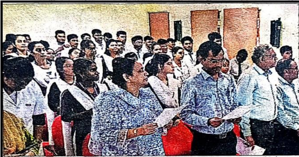
Constitution day being celebrated at IPER.