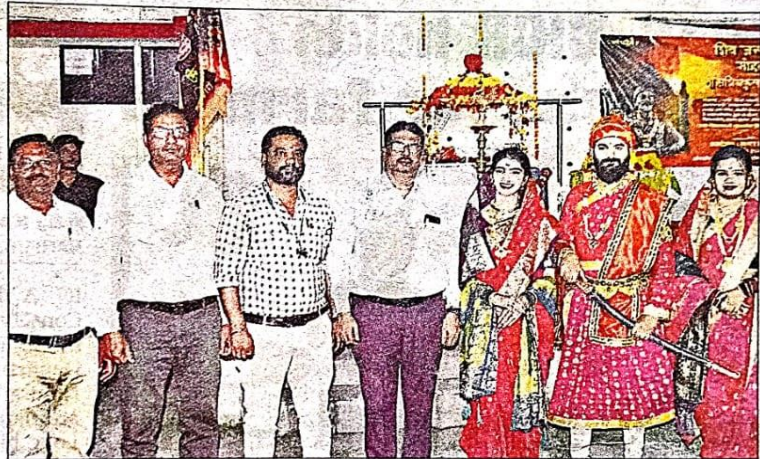
Students and faculty members from IPER dressed as Chhatrapati Shivaji Maharaj, Saibai and Rajmata Jijabai.