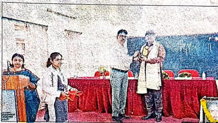
One of the guests being felicitated on the occasion.

ON THE occasion of National Librarian's Day and to commemorate the birth anniversary of Padmashree Dr S R Ranganathan (Father of Library Science in India), a Librarian's Day programme was held at VYWS's Institute of Pharmaceutical Education and Research (IPER), Borgaon (Meghe), the other day.